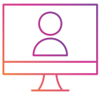
In-Person & Online Events